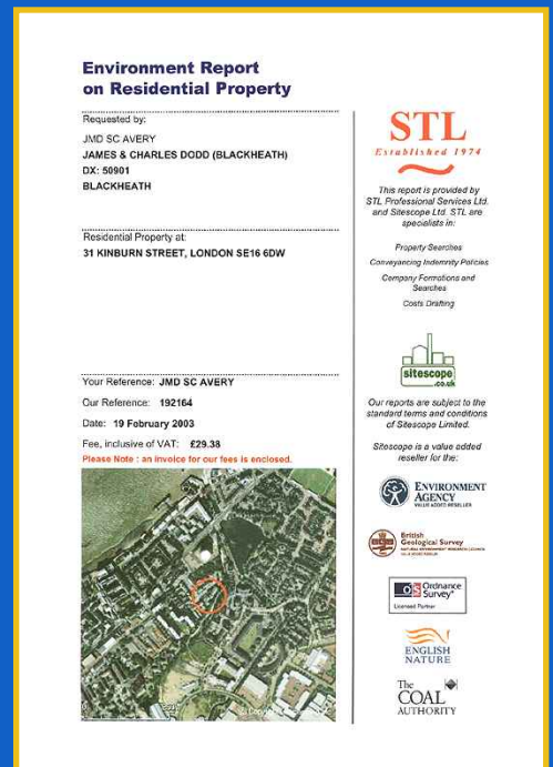
Sample report featuring aerial photography

"Feedback from our clients regarding the incorporation of aerial photos in our property searches has been very positive - the photos provide an attractive and clear guide to the site assessment, route planning and surrounding land use of any property in England and Wales."